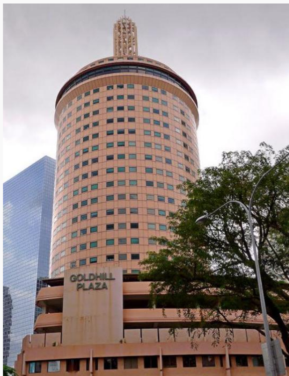
51 Goldhill Plaza

We're excited to share that Ulink Assist has moved! Our new location places us in the heart of Singapore's healthcare district, enabling faster, closer and more coordinated care for your members.